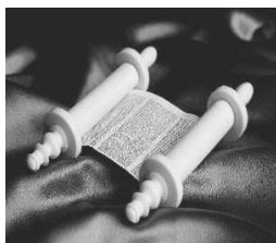
Beth El Services