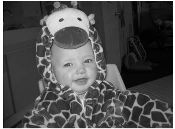
Even our infants dress up on Purim.