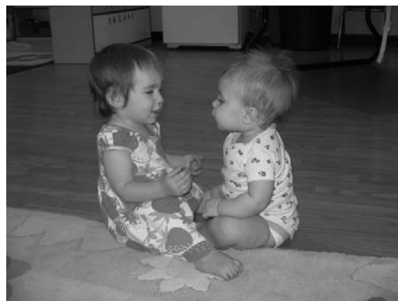
"Baby talk" - they must be talking together saying what a great time they had in the infant room. That week they got to have water play and did pudding painting. Yum!