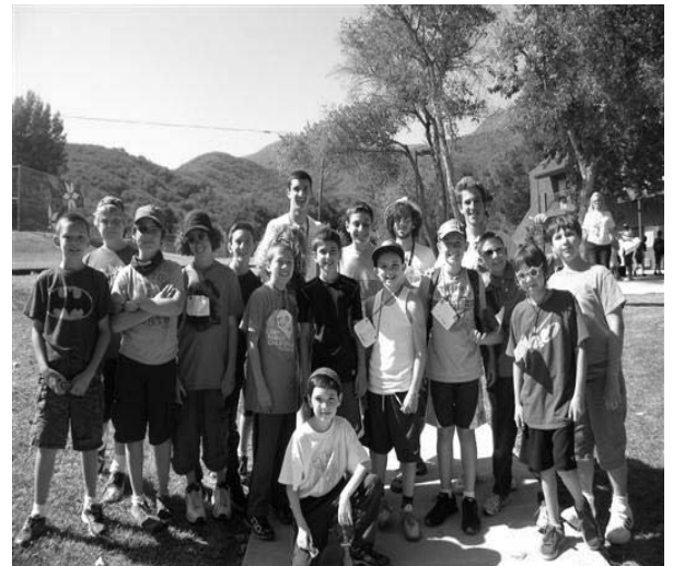
First day at Camp Ramah - Ojai, 2012