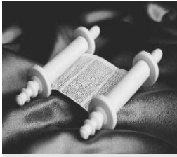
Beth El Services