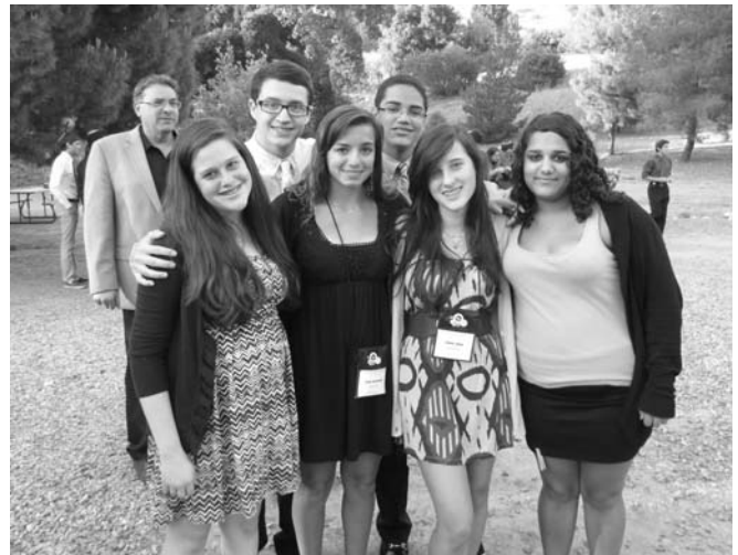
USY Kinnus, May 2012