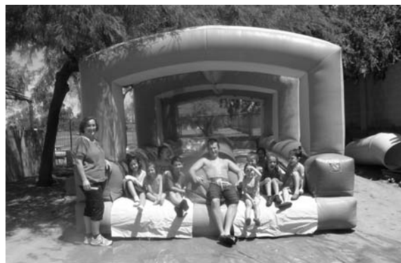
Pictured here are the Pre-K-1st graders enjoying some fun in the sun during last years Camp Yad B'Yad.